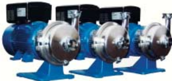
Kalrez® parts in pumps and valves help maintain purity in process fluids and meet critical health and safety requirements.